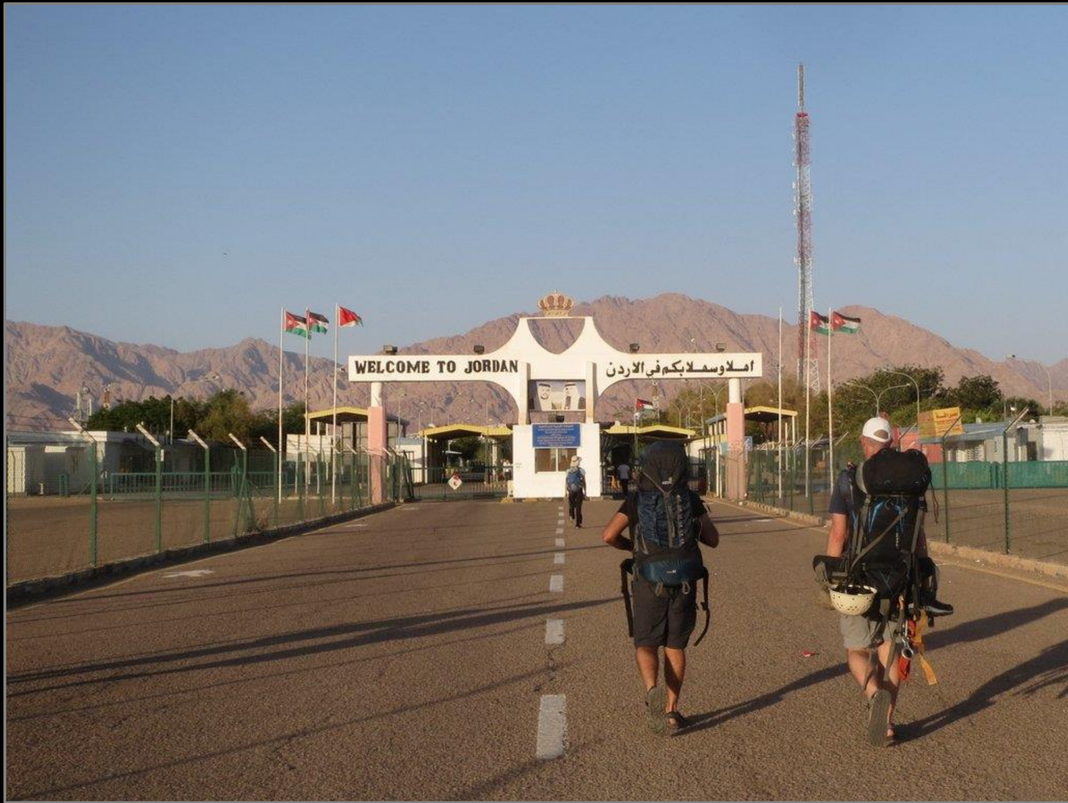
Day 0 – Crossing the boarder near Eilat