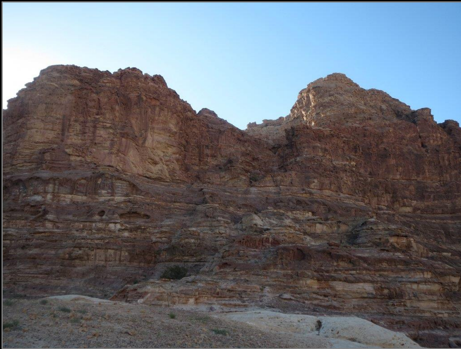
Day 2 – ascending Jabel Armal