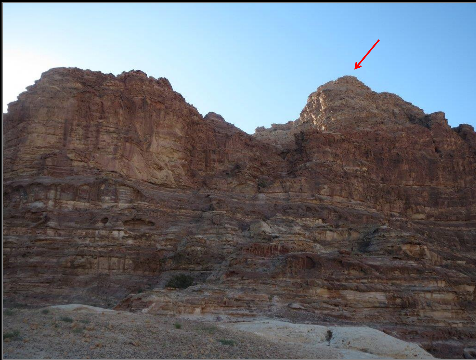
Jebel Armal peak, our destination