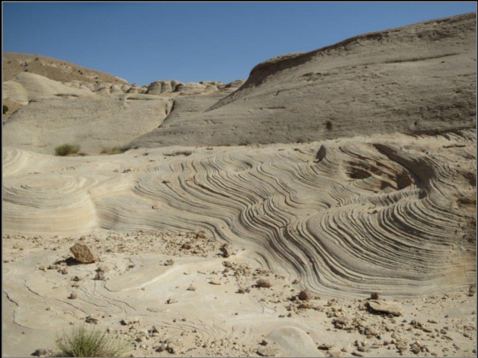
Ras Hurma area