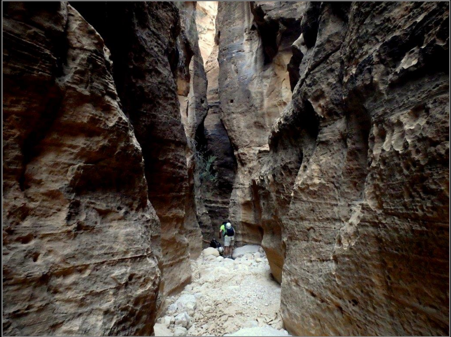
Day 3 – Wadi El-Uyeva